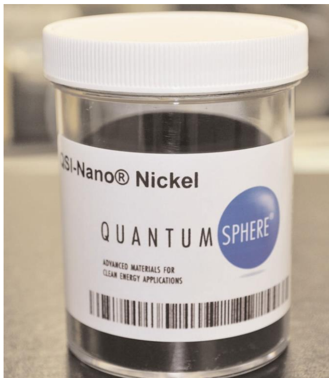
QSI-Nano® nickel powder